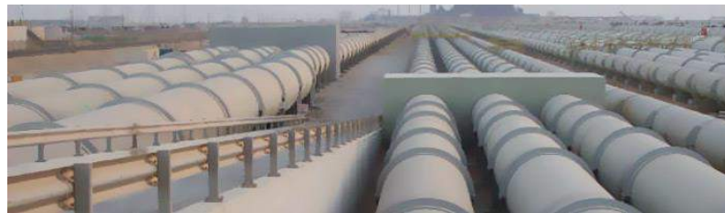
Glass Reinforced Polyester (GRP) & Glass Reinforced Epoxy (GRE) Pipes (Future Pipe Industries)