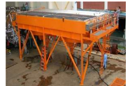
S&W Air Cooler