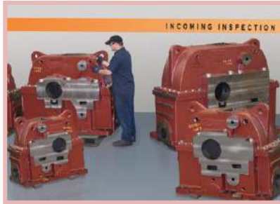
Increasing & Reducing Gears (Philadelphia Gear, USA)